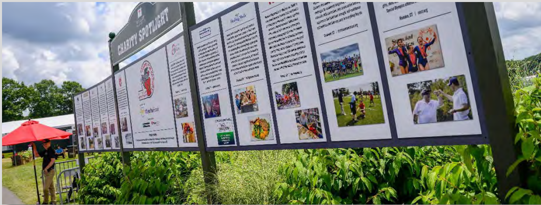
Logo Recognition on Birdies for the Brave Charity Golf Tournament Spotlight Sign Outside the Patriots' Outpost