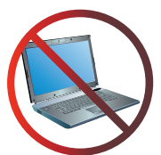
Computers or Laptops