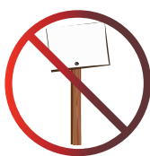
Posters, Signs, Banners or Ladders