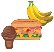
Outside Food (must fit within a clear, 1-gallon zip-top bag)