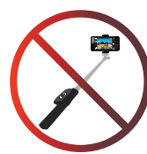
Selfie Sticks and GoPoles