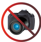
Cameras (Thurs - Sun) & Lens Larger than 6" (Mon - Wed)