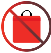
Seat Cushions with Carrying Case or Pockets