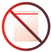
Tinted Plastic Bag