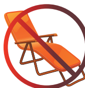
Lounge or Over-sized Chairs with Extended Foot Rests