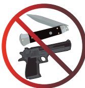
Knives, Firearms or Weapons of Any Kind