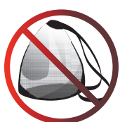
Mesh Synch Bag