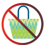
Printed Pattern Plastic Bag