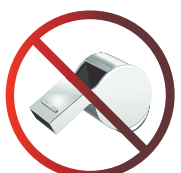
Whistles, Horns or Noise Makers