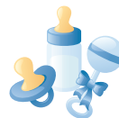
Infant Supplies (Infant must be with Carrier)