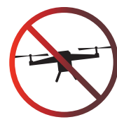
Drones, Remote-Controlled Model Aircrafts or other devices that can be operated in airspace