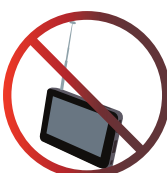
Radios, TV's, or Other Electronic Noise Producing Items