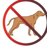
Pets (with the exception of Service Animals)