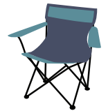
Collapsible Chair without Chair Bag