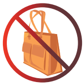
Opaque Bags Larger than 6" x 6" x 6" (In their natural state)