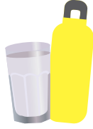
Reusable plastic or metal cups/bottles that are empty upon entry and exit and cannot hold more than 32-ounces