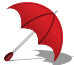
Umbrella without Sleeve