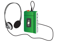
Portable Radio with Headset