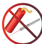
Fireworks, Laser Pointers or Other Explosives