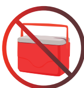
Beverages or Coolers of Any Kind