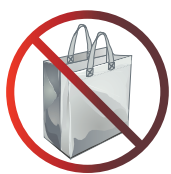
Clear Tote Bags, Plastic, Vinyl or Other Carry Items Larger than 12" x 6" x 12" (In their natural state)