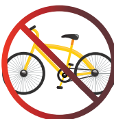
Motorcycles, Mopeds, Tricycles, Bicycles, Skateboards or Hoverboards