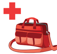
Medically Necessary and Infant Diaper Bags