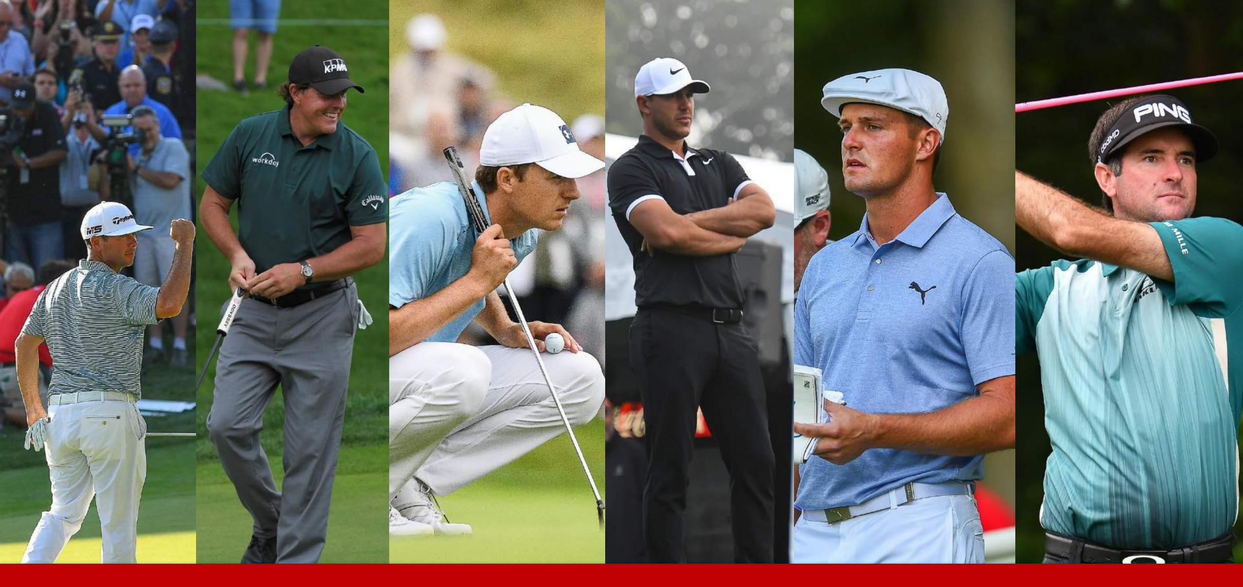
2019 TOURNAMENT HIGHLIGHTS