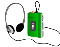
Portable Radio with Headset