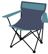
Collapsible Chair without Chair Bag