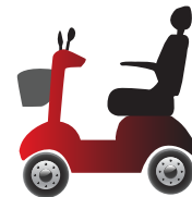
Personal transportations devices for mobility aid such as a motorized wheelchair or scooter