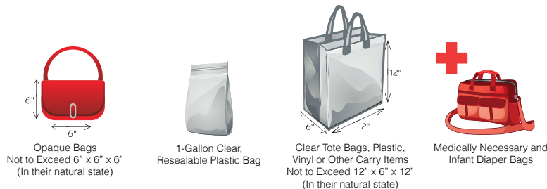
Opaque Bags Not to Exceed 6" x 6" x 6" (In their natural state)

The following bags are PERMITTED on tournament grounds: