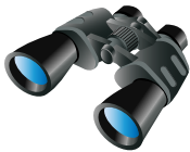
Binoculars without Case