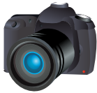
Still Camera without Case & Lens Smaller than 6" (Mon - Wed)