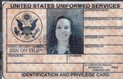
SAMPLE DEPENDENT CARD REQUIRED FOR ANY DEPENDENT OVER AGE 18