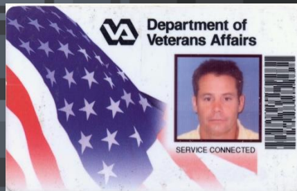
SAMPLE VETERANS CARD