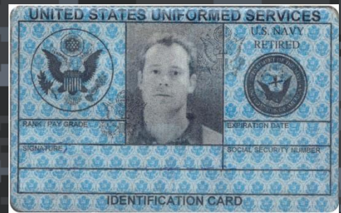
SAMPLE RETIRED CARD