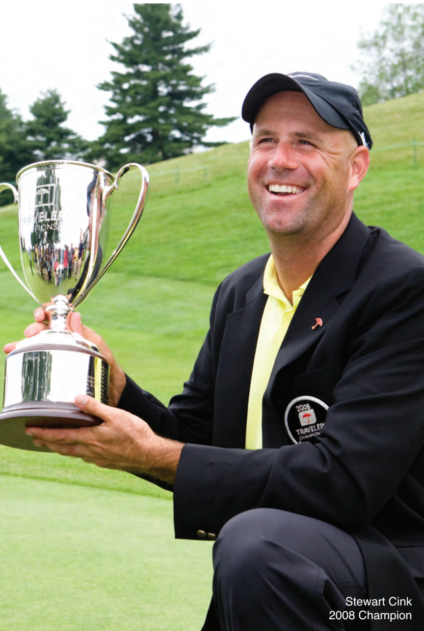
Stewart Cink 2008 Champion