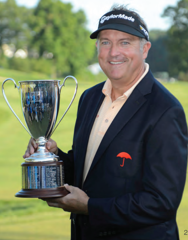
Ken Duke 2013 Champion