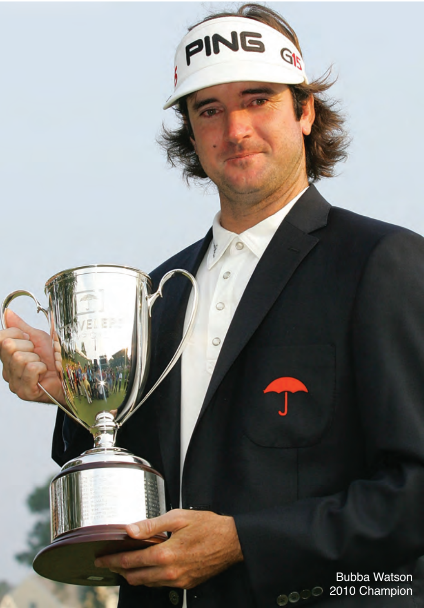
Bubba Watson 2010 Champion