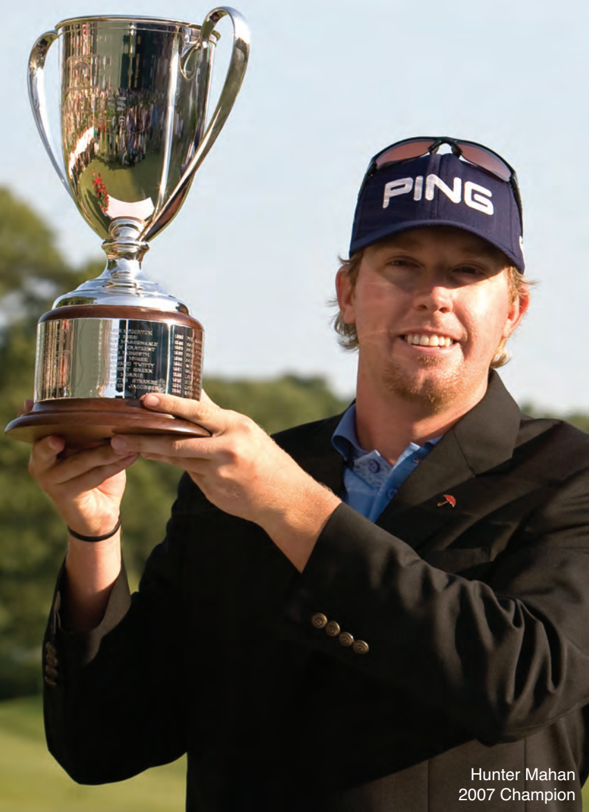
Hunter Mahan 2007 Champion