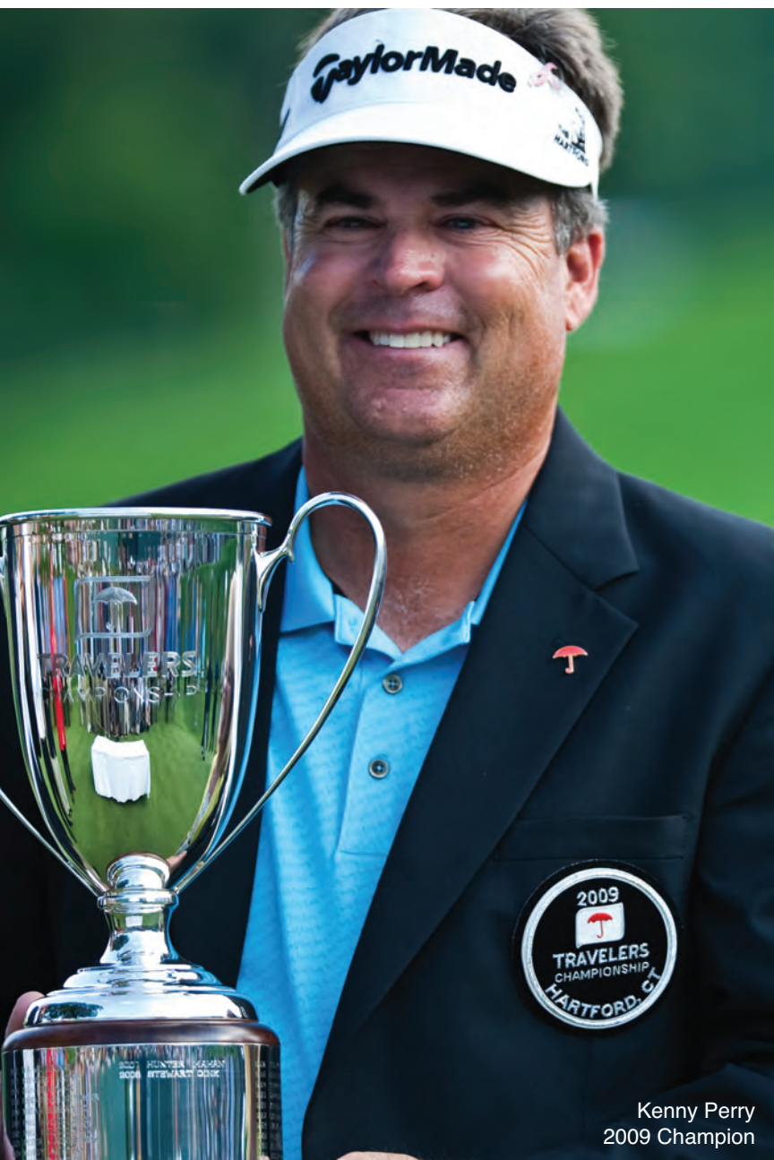
Kenny Perry 2009 Champion